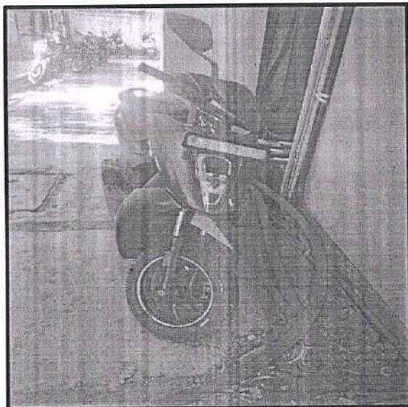
EV bikes of students