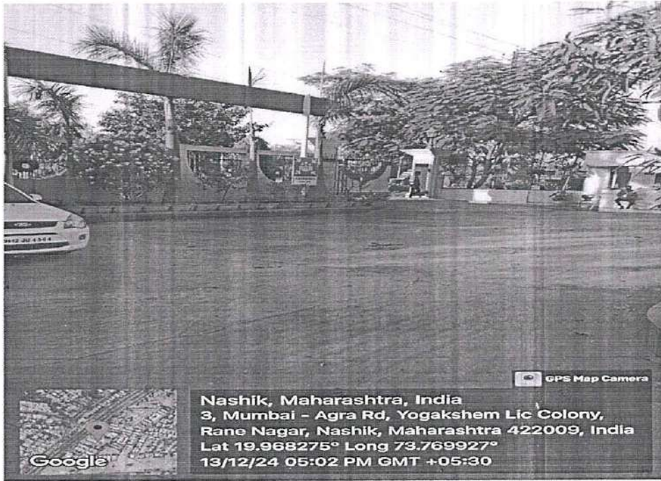
Green and Clean Parking area